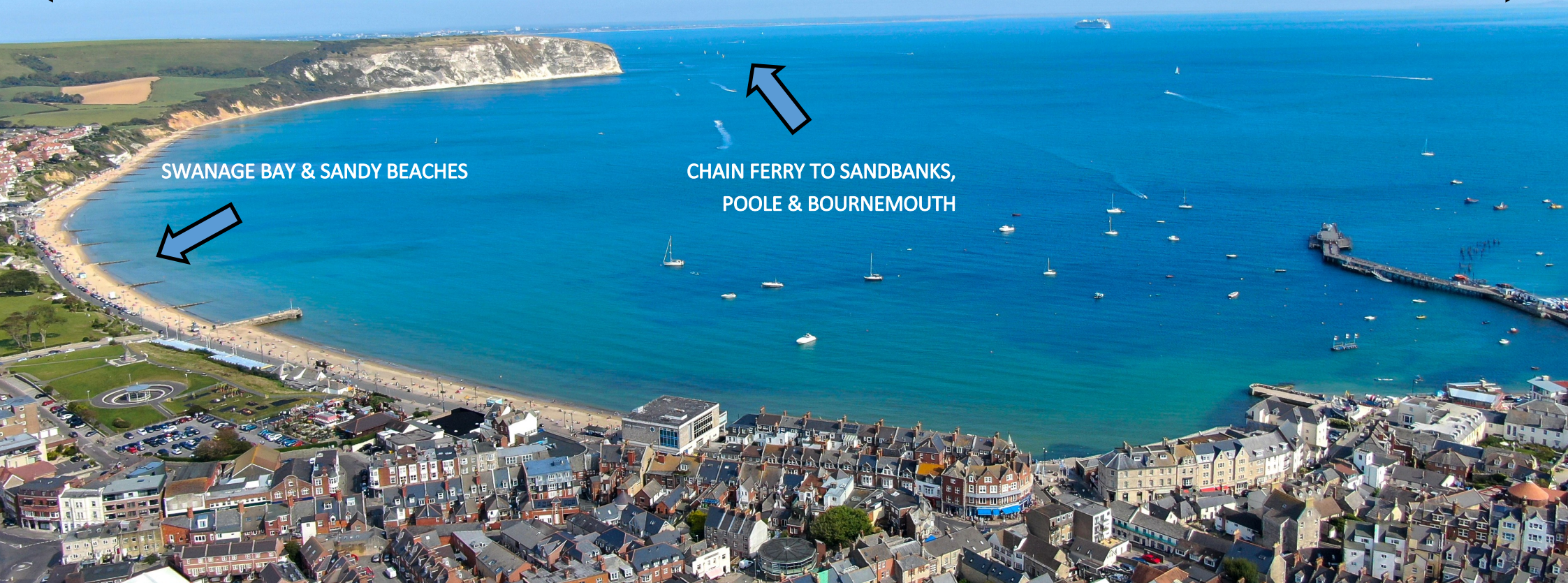
SWANAGE BAY & SANDY BEACHES