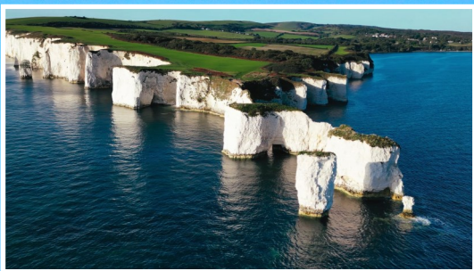
BALLARD DOWN & ROUTE TO STUDLAND