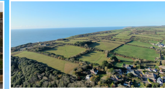
DURLSTON COUNTRY PARK