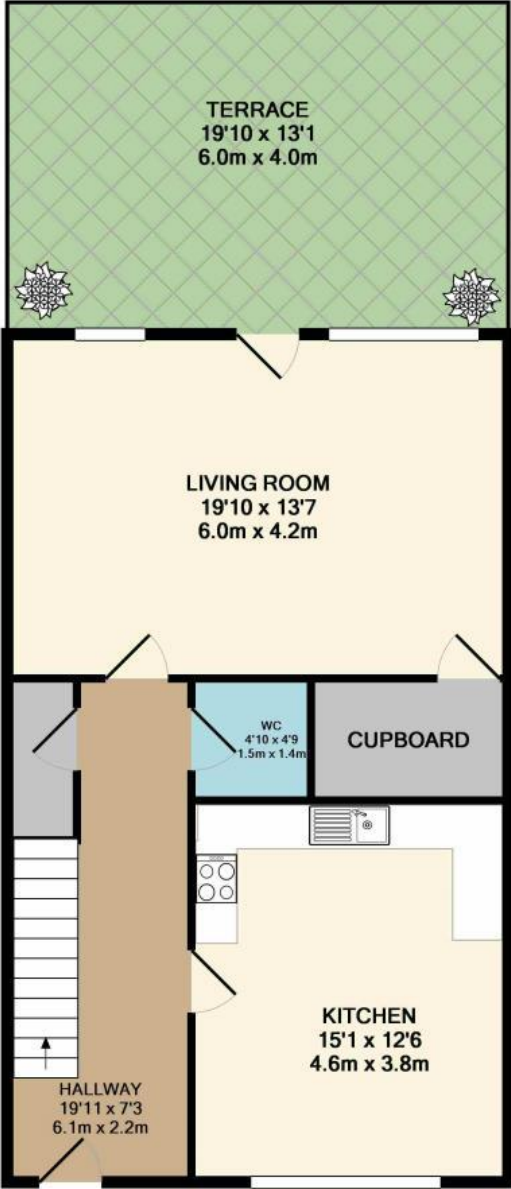
1ST FLOOR APPROX. FLOOR AREA 664 SQ.FT. (61.7 SQ.M.)