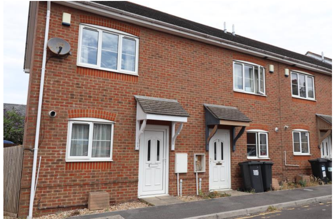
ALBURY & HALL